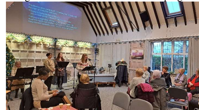
Christmas Service at CAMEO

A suggested donation of £1 a week would be appreciated. No charge is made unless indicated on the programme.