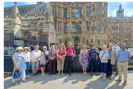
A recent visit to the Houses of Parliament

Usually finishes at 11.30am, except dates indicated with a * will finish later. A suggested donation of £1-£2 a week would be appreciated to cover the cost of speakers and expenses. No charge is made unless indicated on the programme.